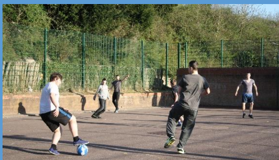
July 2015 Young people playing in the regular Tuesday night football at the compound

Through our weekly football matches in the compound and games of rounders and frisbee over the summer months we have built relationships with over 50 young people in Salisbury's Bemerton Heath community.